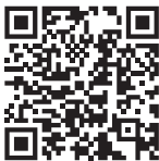
Smartphone app control (WL-Box1 video)